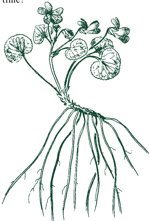
Violet ( Viola flettii )